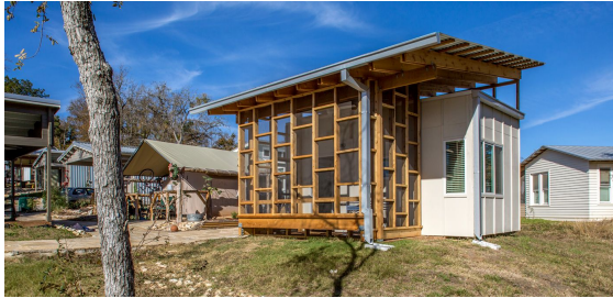
Community First! Micro-home