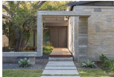
Ridge Oak Residence