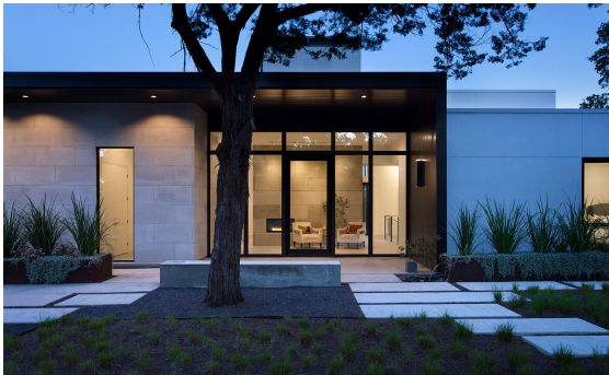
Valley Residence McKinney York Architects