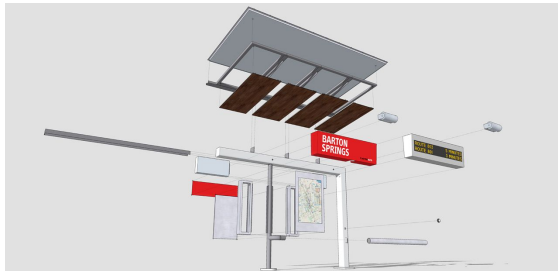
MetroRapid Station Design