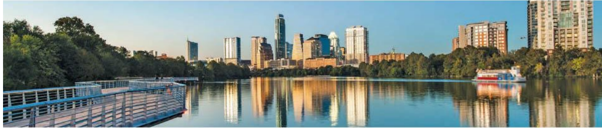
Boardwalk on Lady Bird Lake by Limbacher & Godfrey Architects

AIA Austin is the voice for our region's architecture community. We advocate for our members, the profession, career development, and design excellence. We influence public opinion and policies that shape our built and natural environment.